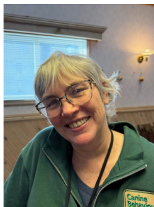
Public relations improvement

MLK Saratoga shares Dr. Martin Luther King's vision of peace and justice for all, building civil and human rights awareness by promoting equity, inclusivity, diversity, anti-racism and social justice through our community events and offerings, engaging via performance, dialogue, conversation, and the arts.