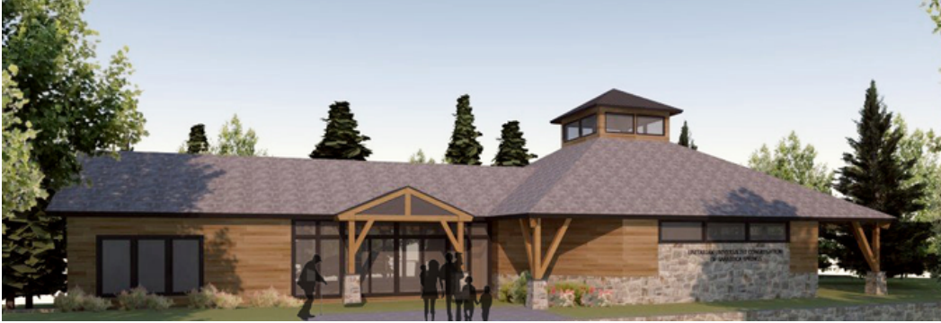
Our new home-coming Dec 2026- 400 Loudon Road